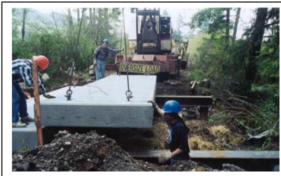
Above: A prefabricated bridge replaces a blocked culvert in the Quillayute River System, helping salmon migrate.

Forestry. Quileute does not own significant timber acreage, but works closely with the timber landowners (state, private, and federal) on salmon habitat restoration projects and wildlife/gathering issues. Our Timber Fish Wildlife biologist must be apprised of all the forest practice regulations, as well as salmon recovery protocol. Our biologists, attorney, and policy personnel serve on a number of committees regarding timber harvests and their potential impacts on plant and animal resources, or water quality. We plan and join in a number of restoration projects with the landowners.