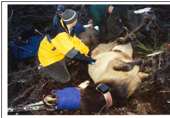
Above: tribal members collar an anesthetized elk for herd population studies with the state.

Wildlife. Quileute has received a number of grants (BIA, USFWS), to study local elk population numbers, health, and forage habits. Locally, elk do not yet show chronic wasting disease, but suffer from a number of other stresses related to hunting practices and available forage. Our data, combined with other studies, will help to adjust management protocol as needed.